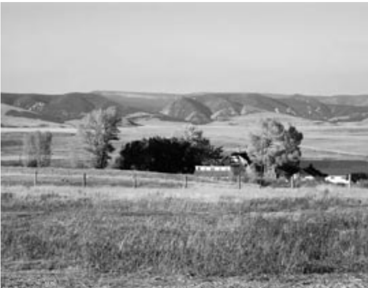
The Bair Ranch

sagebrush reduction and overall increased grass production resulted in a current grass surplus. Murphy estimates that the ranch should support 1,000 head of cattle and approximately 2,400 sheep. By holding back animals, he estimates he will come close to reaching those herd numbers this year.